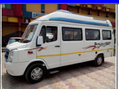
14 Seater Tempo Traveller