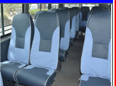
14 Seater Tempo Seat